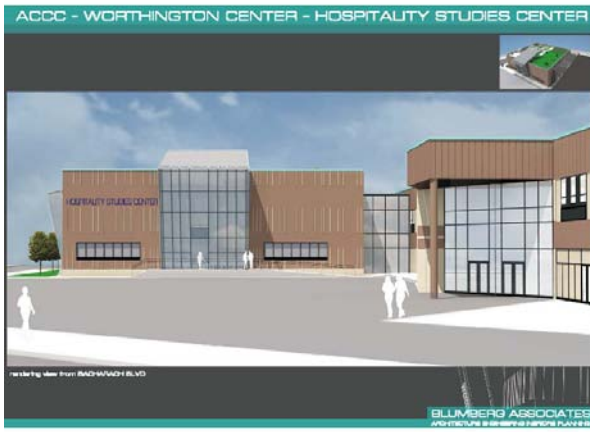
Current building on right; addition on left.