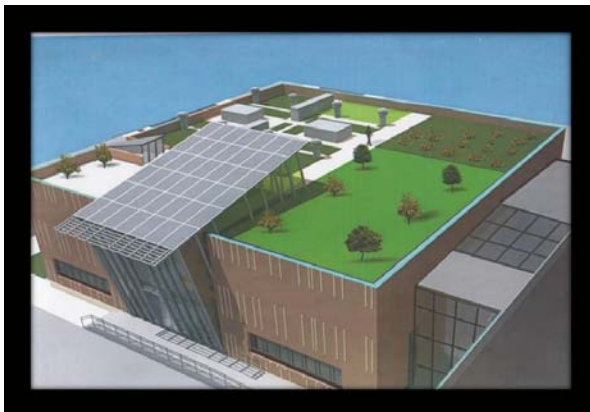
View of solar panels and “green roof”