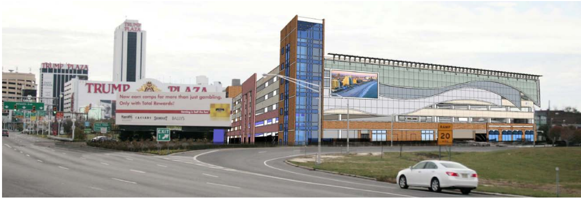
Perspective from Fairmount Avenue: